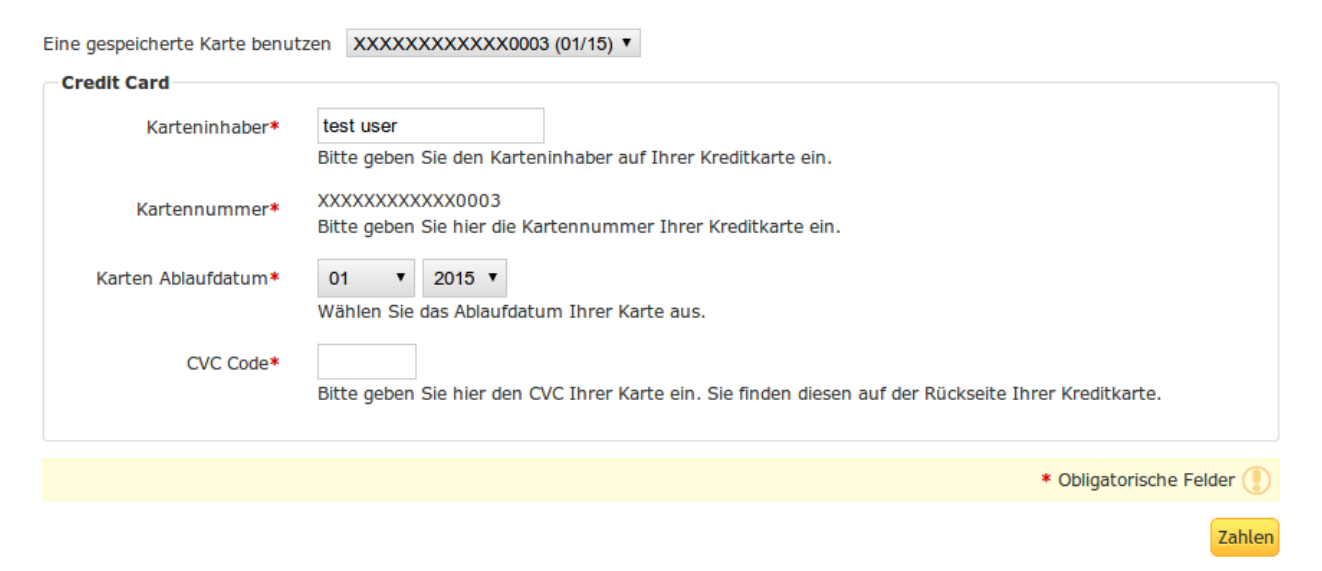
Figure 6.1: Alias Manager Integration in JTL

With the Alias Manager, your customers can securely save their credit cards with TeleCash for later purchases. It is enabled by activating the option "Alias Manager" in the configuration of the <a href="Payment Method">Payment Method</a> The customer can then choose from his or her saved credit cards without having to re-enter all the details.