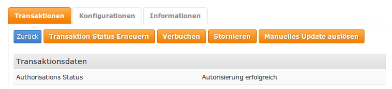
Figure 6.1: Cancelling of Orders in the JTL backend

In order to cancel an order, open the corresponding transaction. By clicking Cancel , a cancellation of the payment occurs with TeleCash. The reserved amount on the customer's card will be released automatically.