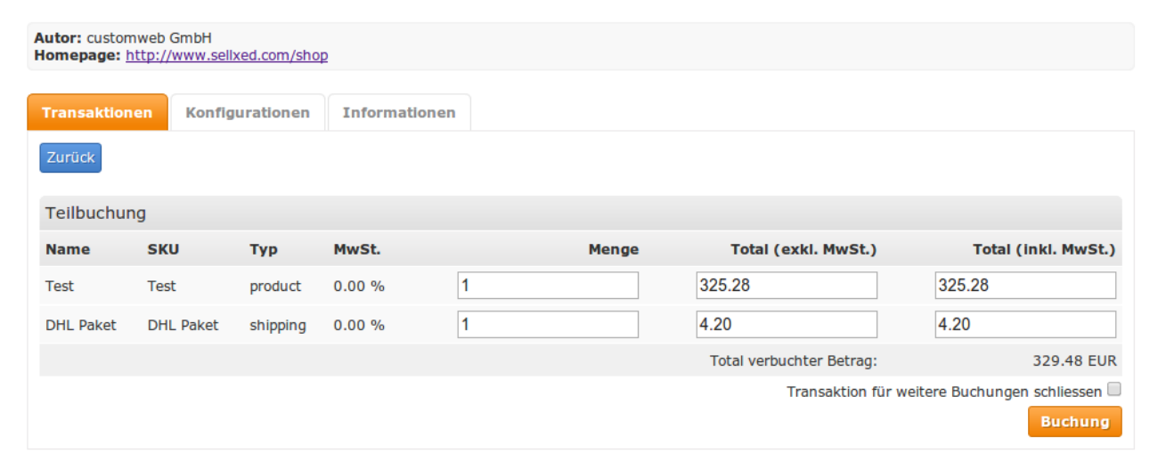
Figure 6.1: Capturing of Orders in JTL backend

In case you do not want to capture all items of the order, you can also close the transaction for further captures.