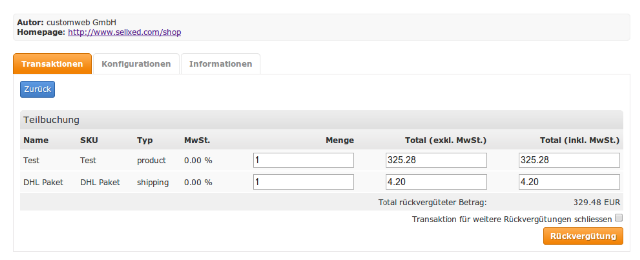
Figure 6.1: Refunds Directly from Within the JTL backend

You can also create refunds for already debited transactions and automatically transmit these to TeleCash. In order to do so, open the invoice of the already debited order (as described above). By clicking on Refund a dialog box for refunds will open up. Insert the amount you wish to refund and then click on Refund . The transaction will now be transmitted to TeleCash.