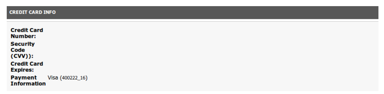
Figure 6.1: Transaction Information

Below you will find an overview of the most important features in the daily usage of the TeleCash module.