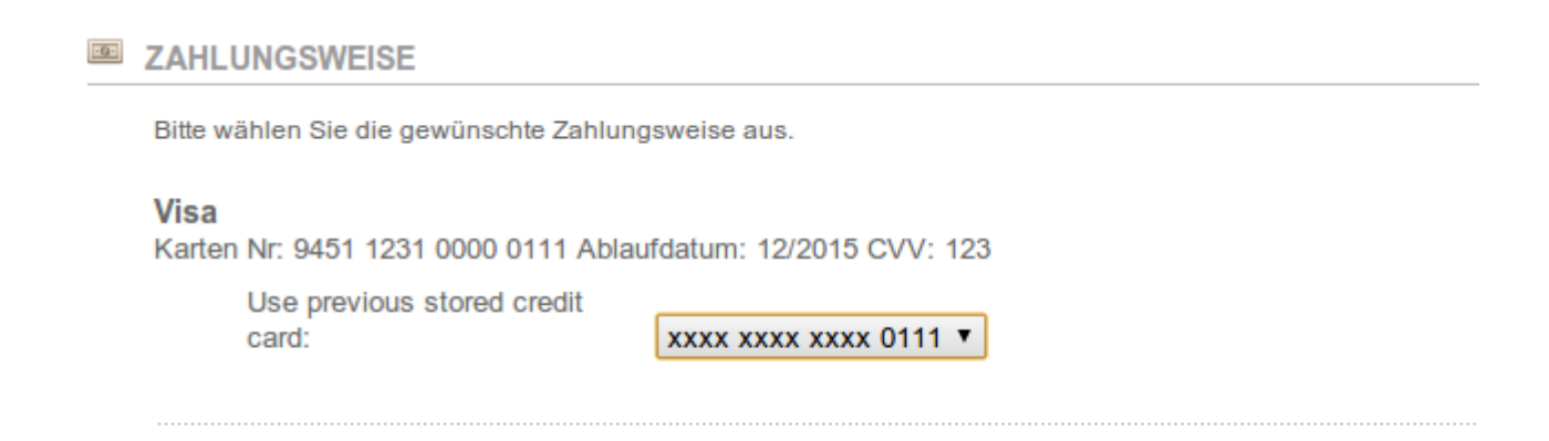
Figure 6.1: Alias Manager