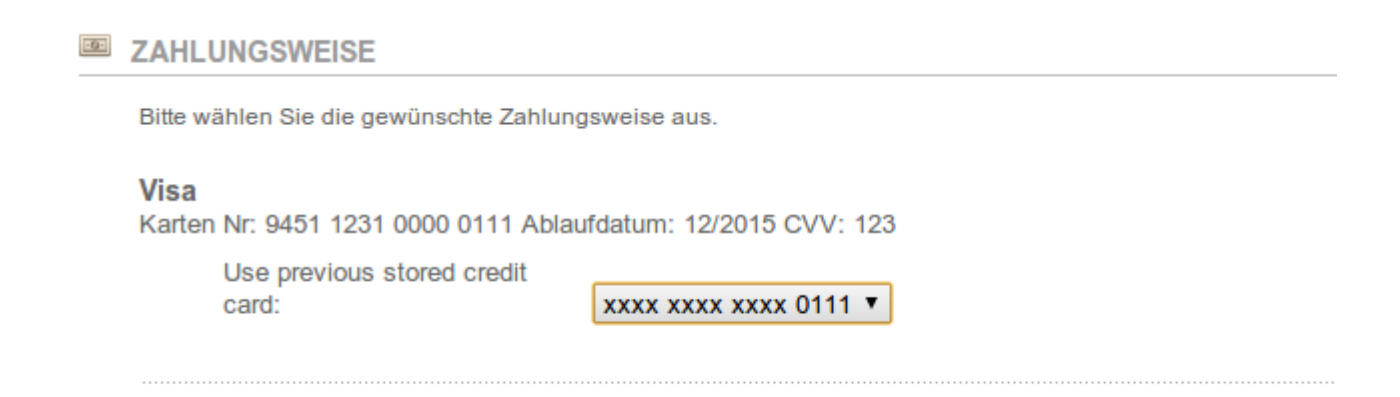
Figure 6.1: Alias Manager