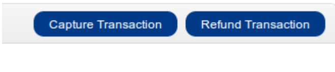
Figure 7.1: Capture or Cancel in OpenCart.