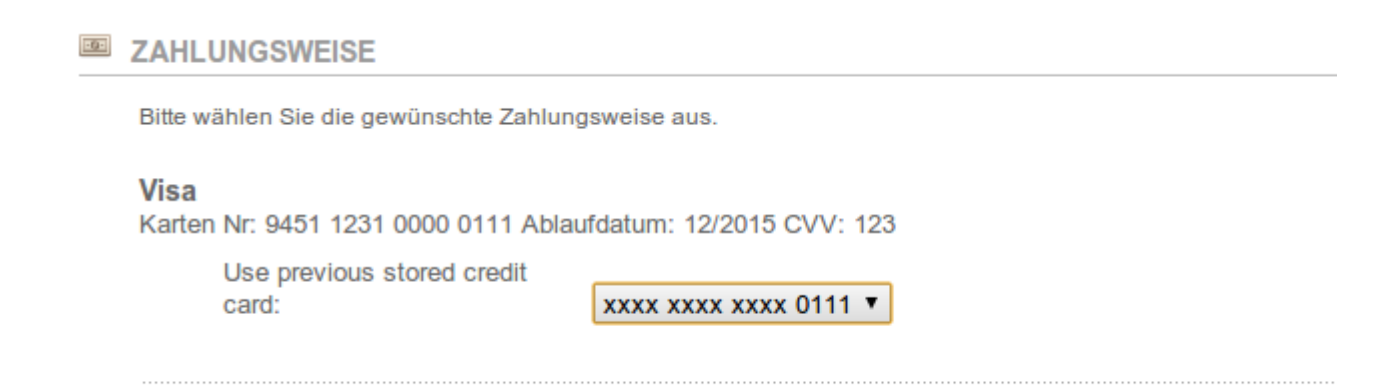
Figure 6.1: Alias Manager