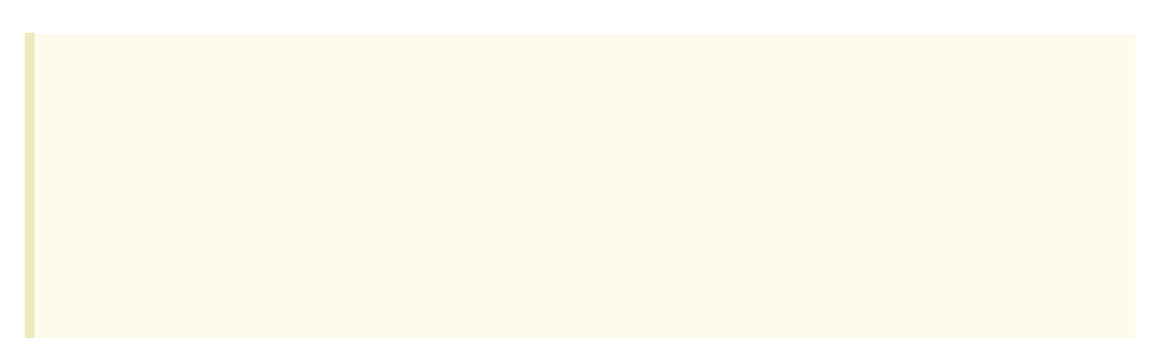
Figure 2.1: Configuration of the feedback URL for the HTTP-Feedback.